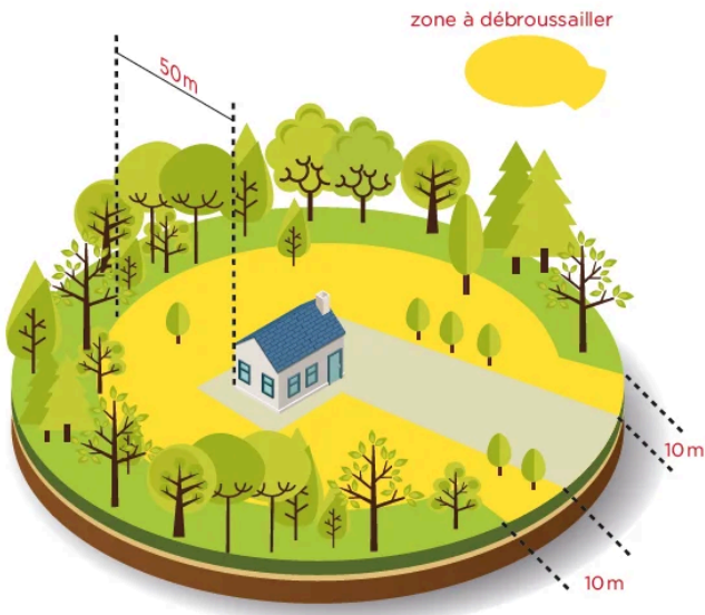
Figure 1. Compulsory brush clearing strips around building and access road. Author: Mairie de Saint Christol lez Alès. | © Mairie de Saint Christol lez Alès, ©.

The French Forestry Code requires landowners to clear the vegetation surrounding their buildings and accesses. Online maps indicate who is affected and where the limits of their responsibility lie.