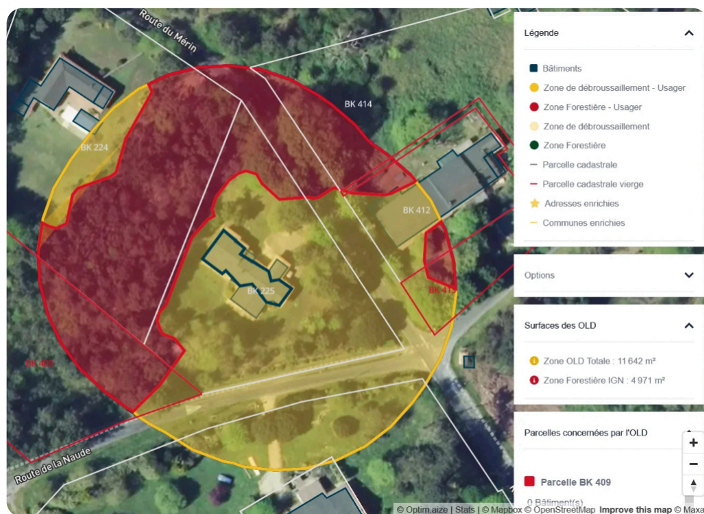
Figure 5. OLD strip (non-forest in yellow, forest in red) around a building, with cadastral reference numbers of the plots, as seen in OÙDÉBROUSSAILLER.FR. Author: OÙDÉBROUSSAILLER.FR. | © Optim.aize

OÙDÉBROUSSAILLER.FR and the Informative zoning of Compulsory Brush Clearing layer in Géoportail are both used by forest managers in integrated fire management plans.